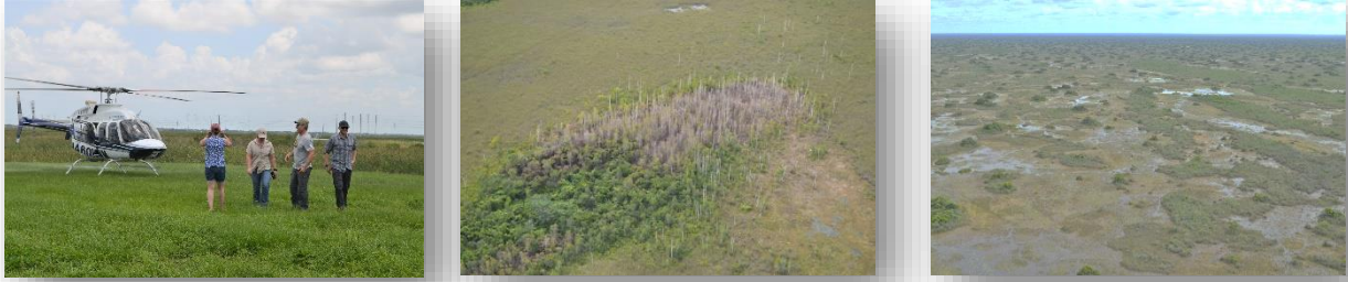
Left to right: Boarding the helicopter to tour the STAs and WCAs; (Aerial view (file photos) of WCA showing a tree island highly invaded and intensively managed for melaleuca trees and Old World climbing fern (yellow/green); to conserve habitat and sheet flow among uninhabited tree islands.

Integral to the proper functioning of this system is consistent optimum water flow, requiring frequent maintenance of floating invasive plants (water hyacinth and water lettuce) that can block water movement and clog intake pipes at strategic pumping stations.