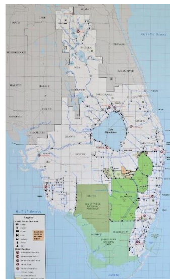
Map of SFWMD Flood Control canals, structures, and Water Conservation Areas

In addition to natural areas, there is substantial aquatic plant control conducted in the tens of thousands of miles of water conveyance canals managed by the South Florida Water Management District (SFWMD) and numerous aquatic plant and mosquito control districts. SFWMD personnel explained their aquatic plant maintenance programs that sustain water transport and flood protection in the extensive canal system in South Florida while maintaining prescribed levels of vegetation in Everglades restoration and storm water treatment areas (STAs), and conserving