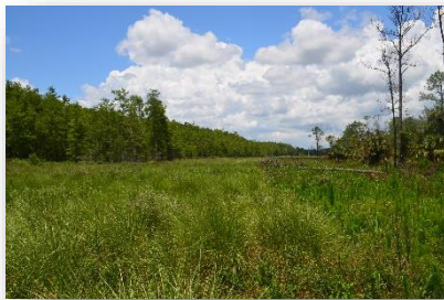
Left: Corkscrew Swamp Sanctuary

Day 4 ended with a walking tour of Corkscrew Sanctuary near Immokalee. This gave participants a first-hand view of aquatic and wetland plants and animals in an undisturbed state. The route from