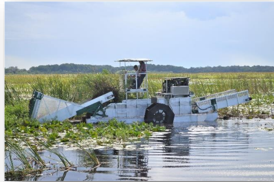
Harvester removing dense masses of primrose willow from Lake Toho.

The tour also included observing a mechanical harvesting operation removing dense masses of invasive primrose willow. While harvesting has proven too slow and costly for large-scale invasive plant management, it is effective in removing dense submersed and floating masses of emergent plant roots, stems, and rhizomes. The Lake Toho tour ended with observation and discussion with