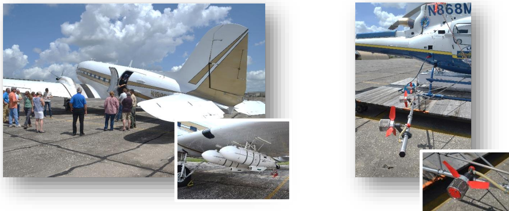
Aerial application platforms and delivery apparatus operated by Lee County Mosquito Control District.

available in liquid or granular formulations. Larvicides are applied any time of day; adulticides are applied only at night. The District uses a variety of detection methods including traps, visual inspections, and sentinel chickens. Pesticides are applied selectively only to areas where mosquito populations reach threshold levels. Aerial applications are delivered by airplane and helicopters. Flight paths are controlled by computer over preestablished control polygons determined from the ground inspections. The onboard computer activates application when the aircraft enters the polygon and adjusts for forward speed to apply pesticide evenly and only to the target zone. This allows pilots to concentrate on flying, especially important since adulticides are applied at night.