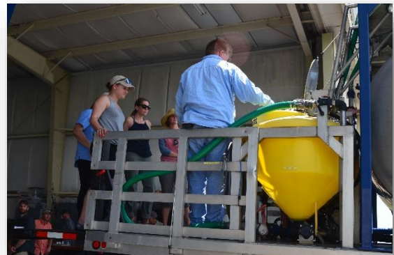
Demonstrating rapid loading and rinsing 2.5-gallon herbicide containers for helicopter applications.