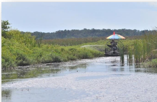
Applying a tank mix of flumioxazin and imazamox to primrose willow

The tour also included observing a mechanical harvesting operation removing dense masses of invasive primrose willow. While harvesting has proven too slow and costly for large-scale invasive plant management, it is effective in removing dense submersed and floating masses of emergent plant roots, stems, and rhizomes. The Lake Toho tour ended with observation and discussion with