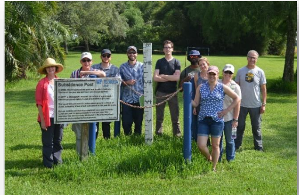
Tour group at the subsidence pole at Belle Glade.

Day 2 ended with a tour of the University of Florida (UF), Institute of Food and Agricultural Sciences (IFAS) research station in the Everglades Agricultural Area in Belle Glade. Researchers discussed efforts to manage agricultural pests, especially in sugar cane, in South Florida's humid climate and organic soils. The group gathered at the subsidence pole that gauges the settling of soils since the removal of native sawgrass and