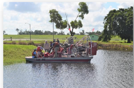
Boarding boats to see floating plant management on Lake Okeechobee.

On Day 3, the group began with an airboat tour of the rim canal and marshes on the south end of Lake Okeechobee near Clewiston, with U.S. Army Corps of Engineers (USACE) and FWC aquatic plant management staff. About 12,000-15,000 acres of floating water hyacinth and water lettuce are controlled with herbicides on the lake each year by for-hire contractors under supervision and monitoring by FWC and USACE. Similar to the cables and structures in water management canals seen the previous day, floating plants accumulate along edges of marshes and in the lake's 25 water control and navigation lock structures and must be managed several times in the same general locations each year. Plants must be selectively managed in and around endangered Everglades snail kite nesting (January-August) as well as waterfowl hunting locations (October-January). Managers again stressed the importance of multiple herbicide active ingredients with