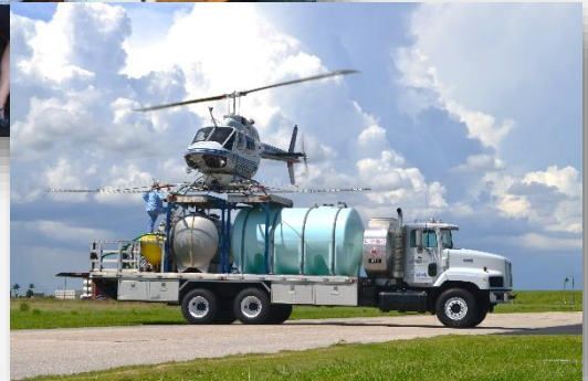
Left to right: Explanation of the various nozzle apertures designed to control droplet size and placement. Support vehicle with self-contained herbicide concentrate and diluent tanks and landing/loading platform.

The helicopter ground crew demonstrated a rapid herbicide loading system that punctures, drains, and applies a water volume equivalent to triple rinsing 2.5-gallon containers in just a few seconds. This not only reduces loading and rinsing time, but also minimizes mixer/applicator exposure.