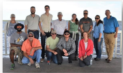
Right: Tour group at the public pier on Lake Okeechobee

Immokalee to Orlando passed the public pier on the north end of Lake Okeechobee, providing insight to the size of the lake and a photo opportunity for the group.